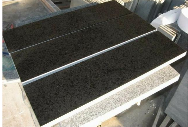
Polishing small size slab