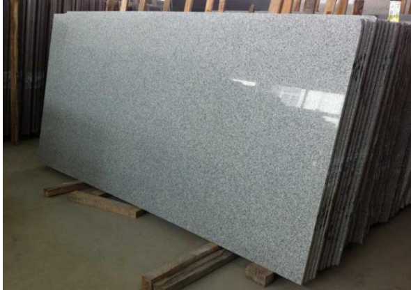
Polishing big slab